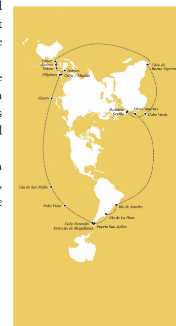
Illustración, Nomad Garden